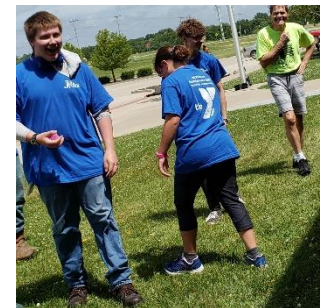
Students enjoying a break.

Job Point's partnership with the Missouri Division of Vocational Rehabilitation and area high schools, the Summer Work Experience Program (SWEP), has officially started this year. The program helps provide incoming seniors with job-related skills. For the third year, Randolph Area YMCA hired students for the six-week program, where students assisted with reception, sanitation, maintenance, landscaping, laundry and child care. C&R Market in Boonville welcomes students back for the second straight year. The Boonville students performed cashiering, bagging, stocking and food service. In addition to the day to day work, SWEP students also attend seminars on work-related skills, including networking, teamwork, communication, harassment and problem solving.